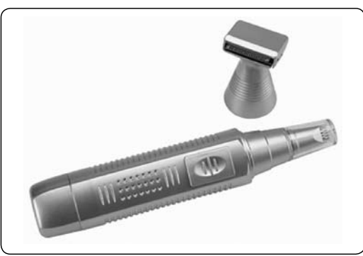
Distributed exclusively by Harbor Freight Tools®. 3491 Mission Oaks Blvd., Camarillo, CA 93011 Visit our website at: http://www.harborfreight.com